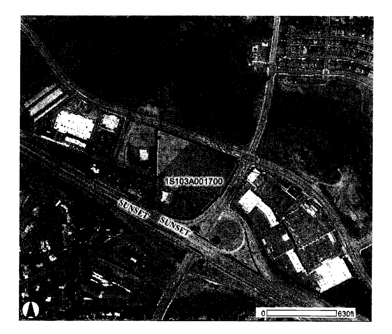
EXHIBIT 1.2 AERIAL PHOTO OF SITE